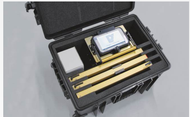
PMS 3 in its transport case