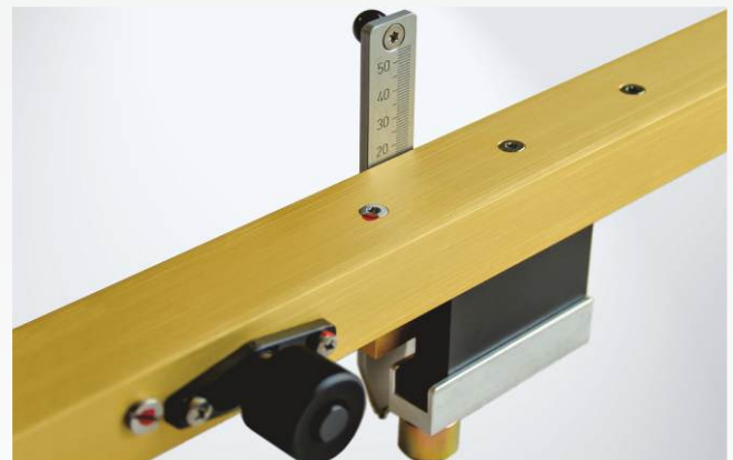
Narrow contact with groove depth measuring unit (option)