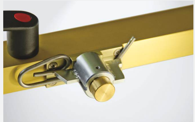
Mounting with test adapter for switch tongues (option)